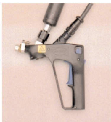
AD-41 Top-Feed Handgun with Swirl Adapter and Hose.