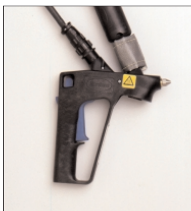
AD-41 Top-Feed Extrusion Handgun.