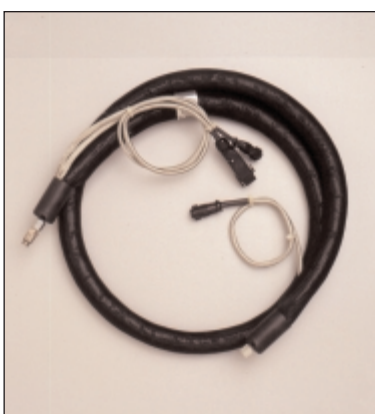
Handgun end of hose has one cordset. Unit end has standard cordset to unit, and second cordset for air control kit needed for swirl and spray patterns.