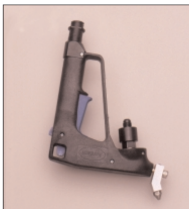
AD-41 Handgun with Down-Apply Extrusion Nozzle.