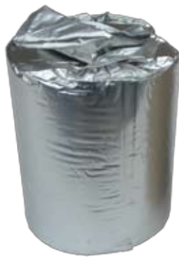
Foil-encased PUR slug

Flow-through output manifold with no dead spaces can accommodate up to three hoses