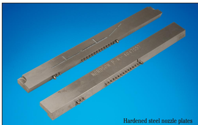
Hardened steel nozzle plates