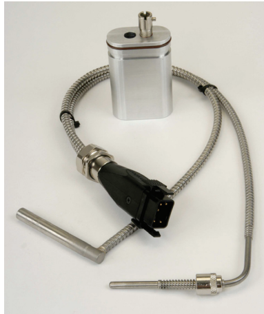
Cordset with integral heater and sensor is easily serviced. Air heating insert is compact and efficient.