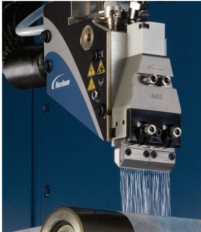
Wide Universal UM50 modules for continuous applications require fewer modules, and Universal Signature™ nozzles dispense farther from webs.