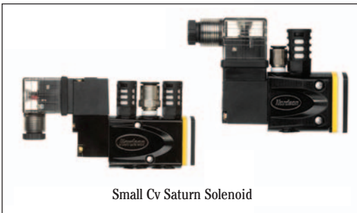
Small Cv Saturn Solenoid

Durable, high-temperature seals deliver excellent performance in demanding applications