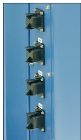
Four additional temperature channels for control of spray guns, heaters, etc.